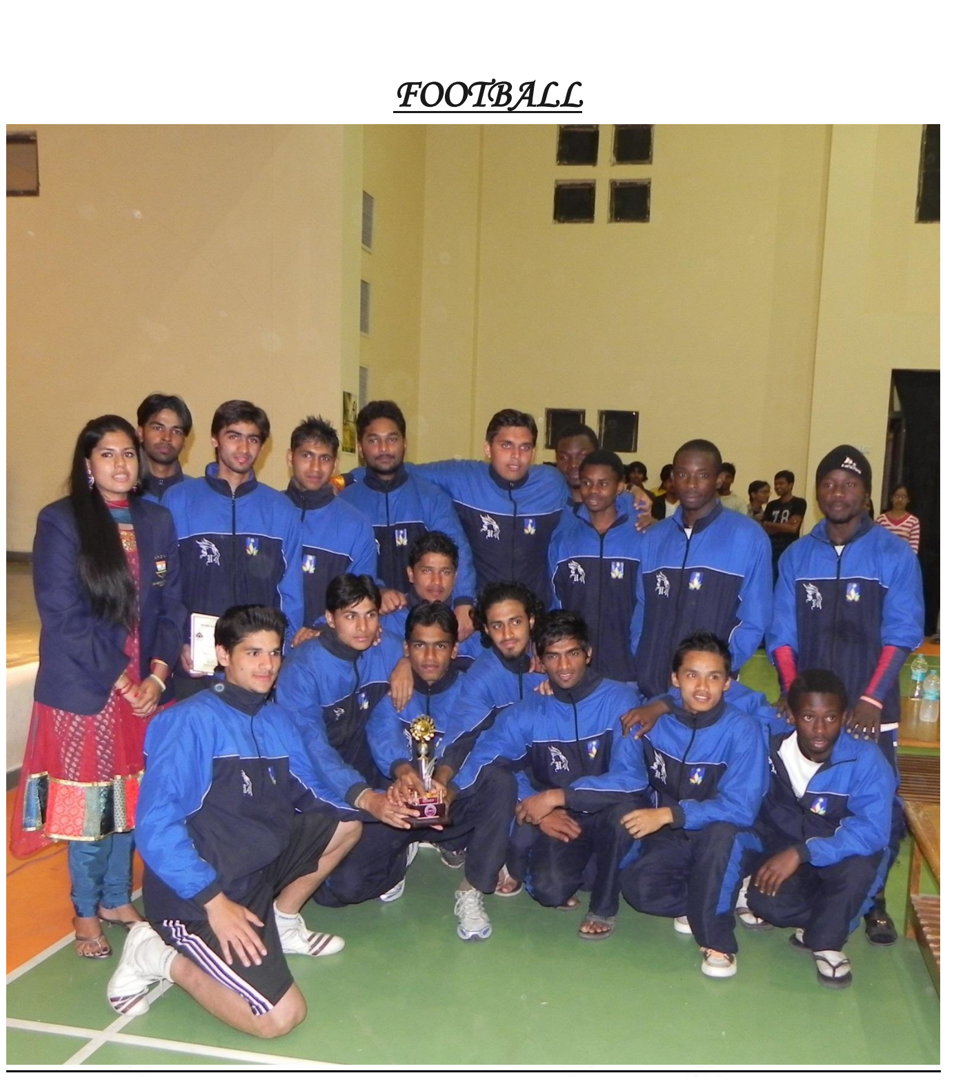
<u>OUR UNIVERSITY FOOTBALL TEAM</u>

The world's most watched game, football combines all the qualities of a sportsman like endurance, team spirit and accurate co-ordination.