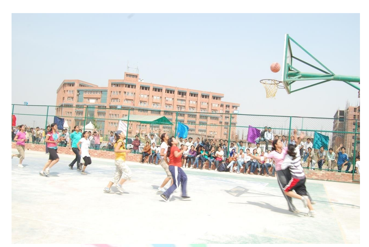
GIRLS INTER BRANCH TOURNAMENT