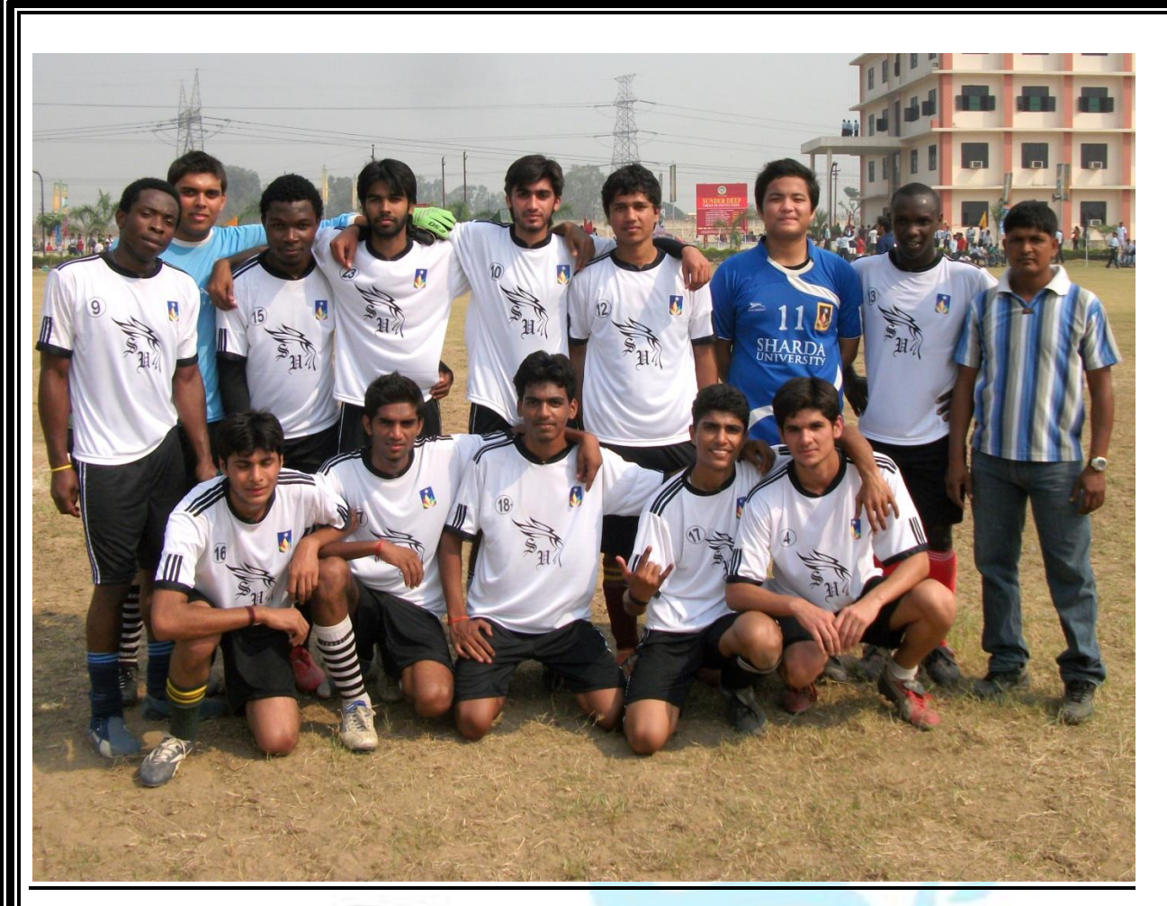
SUNDERDEEP TOURNAMENT, GHAZIABAD