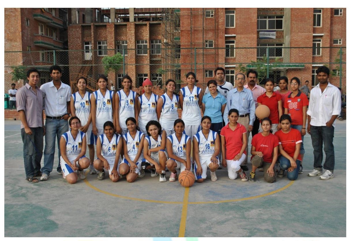
WINNERS SHARDA CUP-2010