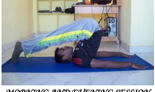
MORNING AND EVENING SESSION